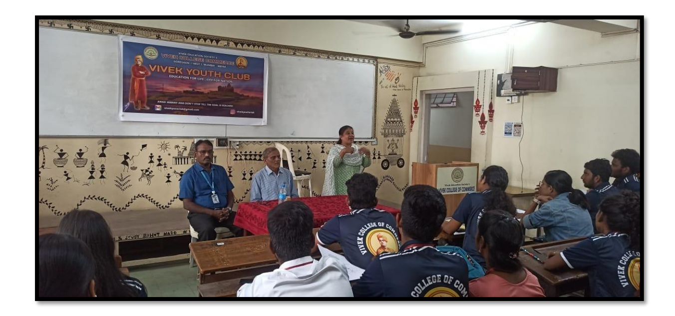
Special Lecture on Sadhana Divas