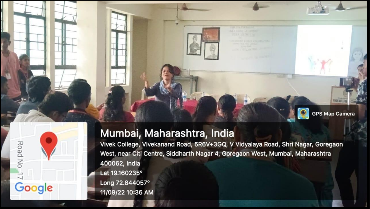
Talk about Swami Vivekananda as a Youth Icon