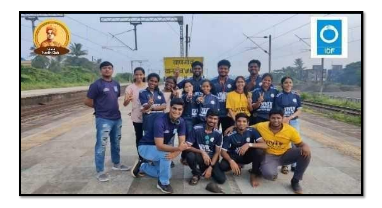
Youth Volunteers AT DHANU ROAD STATION FOR SOCIAL CAMPAIGN.