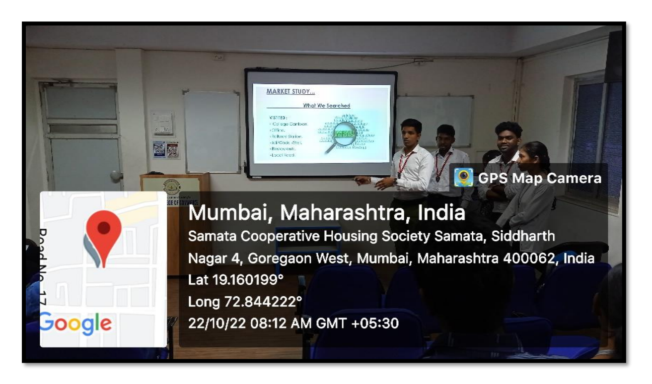
Presentation of Business Project during the Workshop

9. Celebration of Universal Brotherhood Day Vishwa Gandharva Diwas Universal Brotherhood Day is celebrated on 23<sup>rd</sup> September 2022. The Universal Brotherhood Day is celebrated in the month of September since 1893, in the memories of the Shri Swami