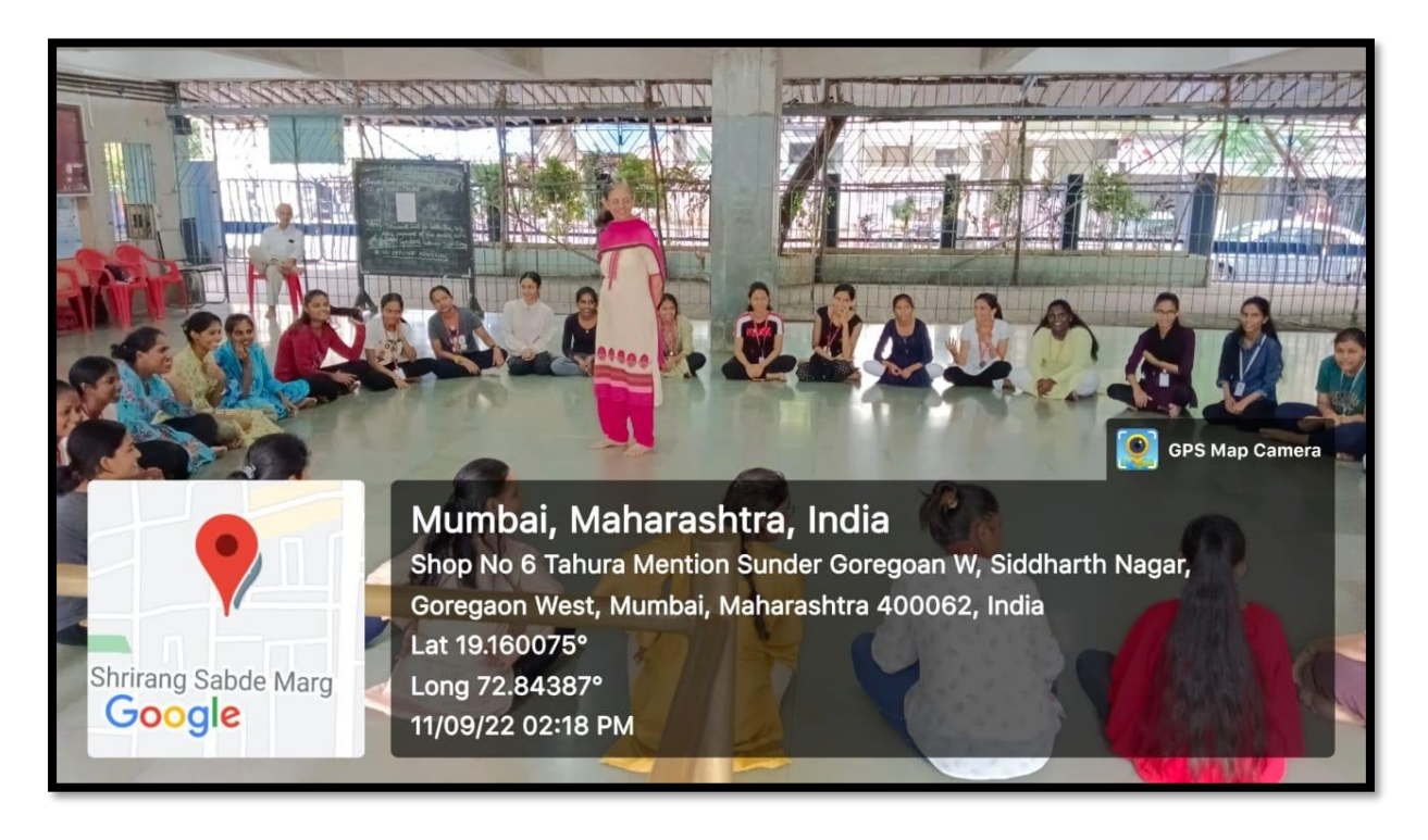
Youth Empowerment Session in progress