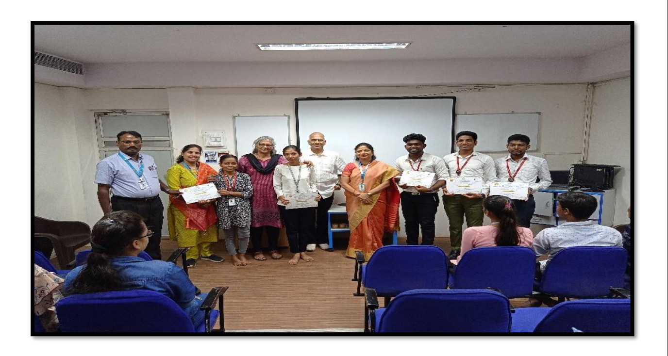
Workshop on Entrepreneurial Development