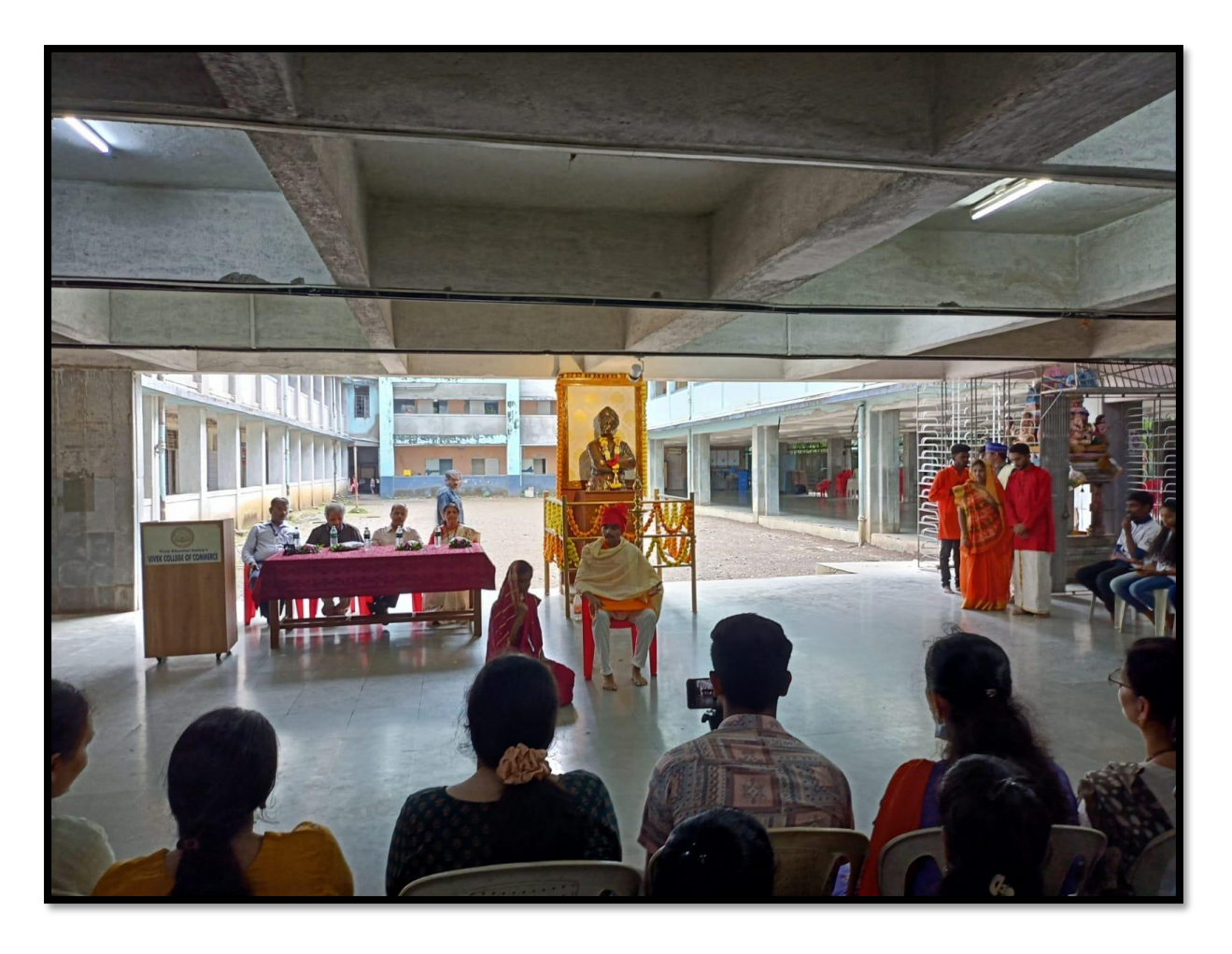
Vivekananda Punyathithi Celebration